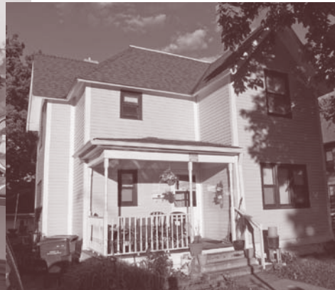
A single-family home on the Hope Block