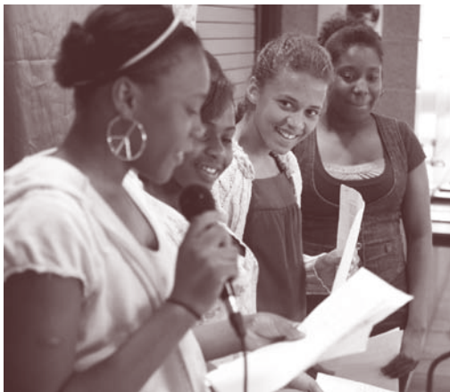
Young girls present their work at a Hope event

“If you have a safe, stable home you can do anything. That’s the one big difference that can change people’s lives.”