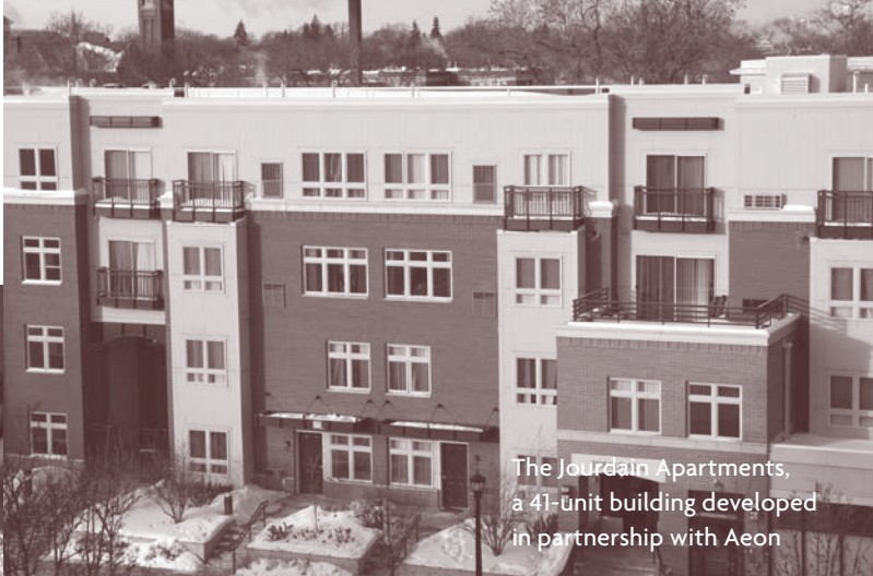
The Jourdain Apartments, a 41-unit building developed in partnership with Aeon