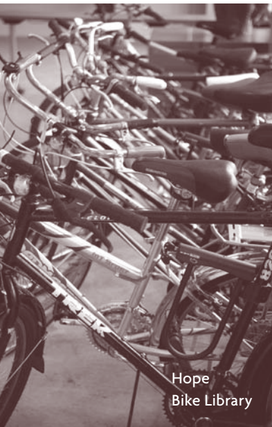
Hope Bike Library