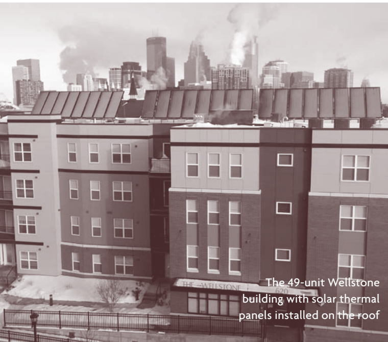
The 49-unit Wellstone building with solar thermal panels installed on the roof