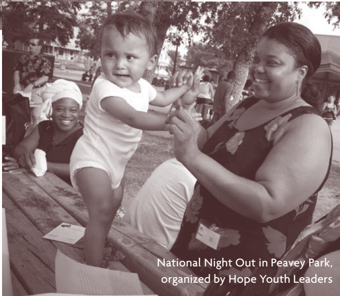
National Night Out in Peavey Park, organized by Hope Youth Leaders