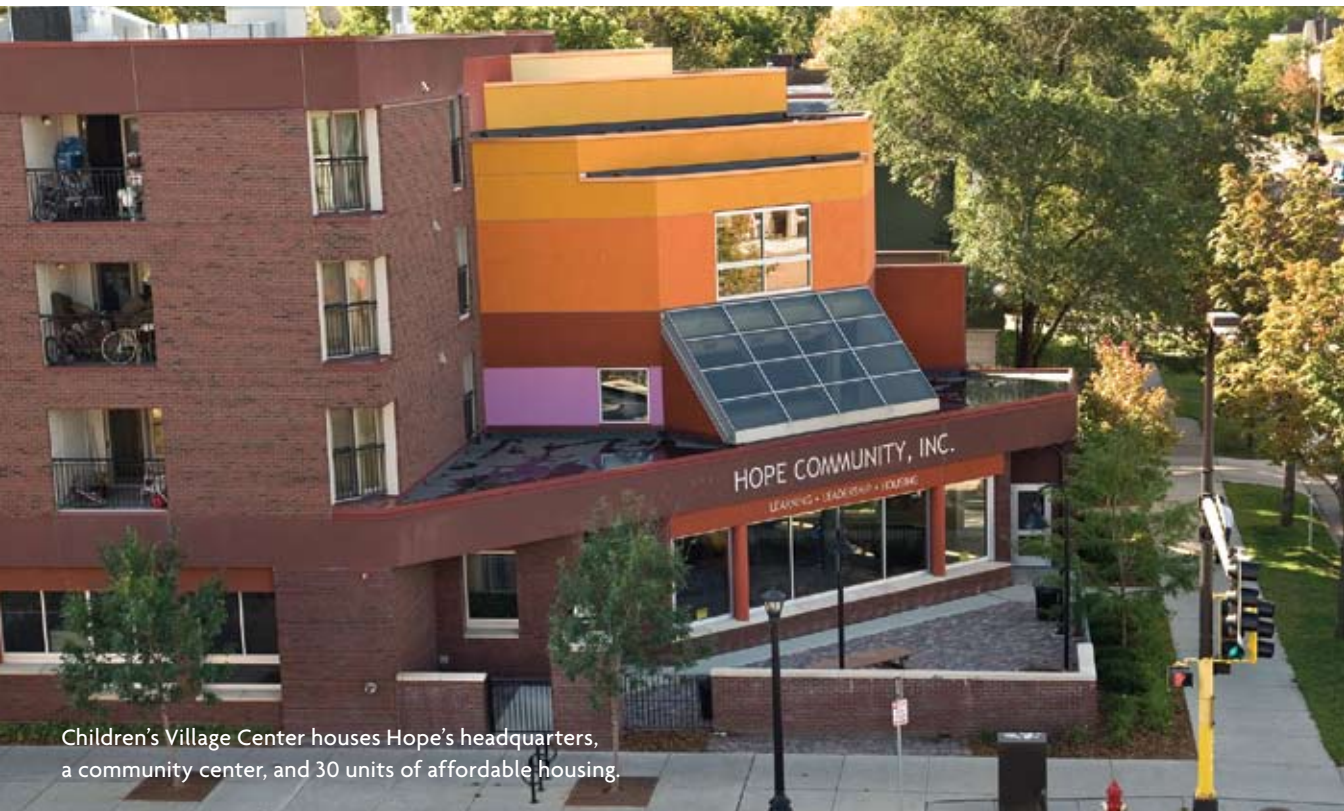
Children's Village Center houses Hope's headquarters, a community center, and 30 units of affordable housing.

Non-profit org. U.S. Postage Paid Twin Cities, MN Permit No. 1261