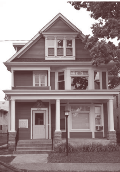
A tri-plex family home on the Hope Block

“It’s the whole atmosphere at Hope—where anyone can just walk in and feel treated equally—everybody has their own say, everybody’s opinions are heard. It’s strongly community-based.”