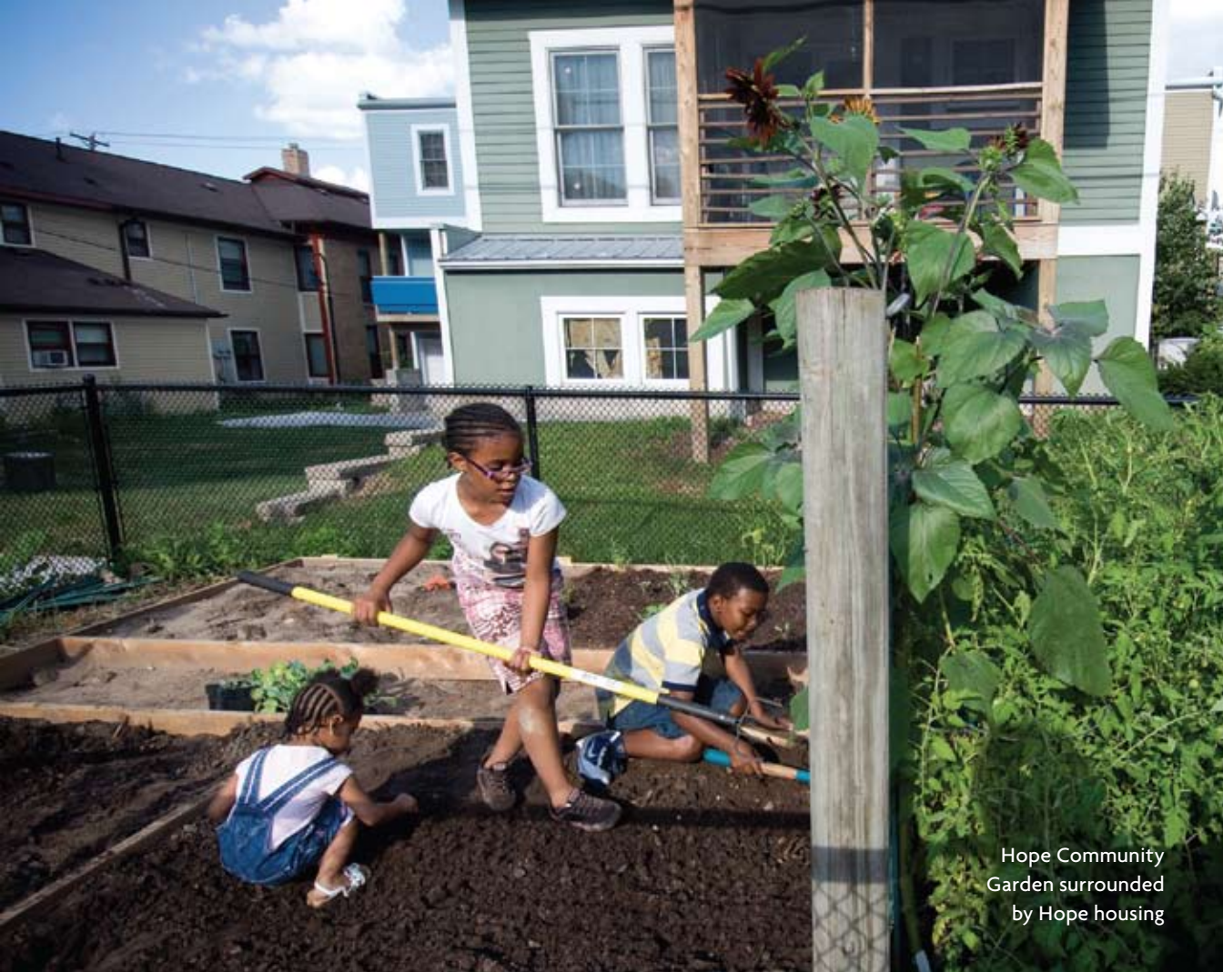
Hope Community Garden surrounded by Hope housing