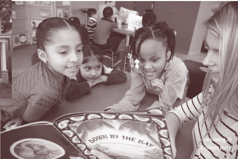
Learning in Community