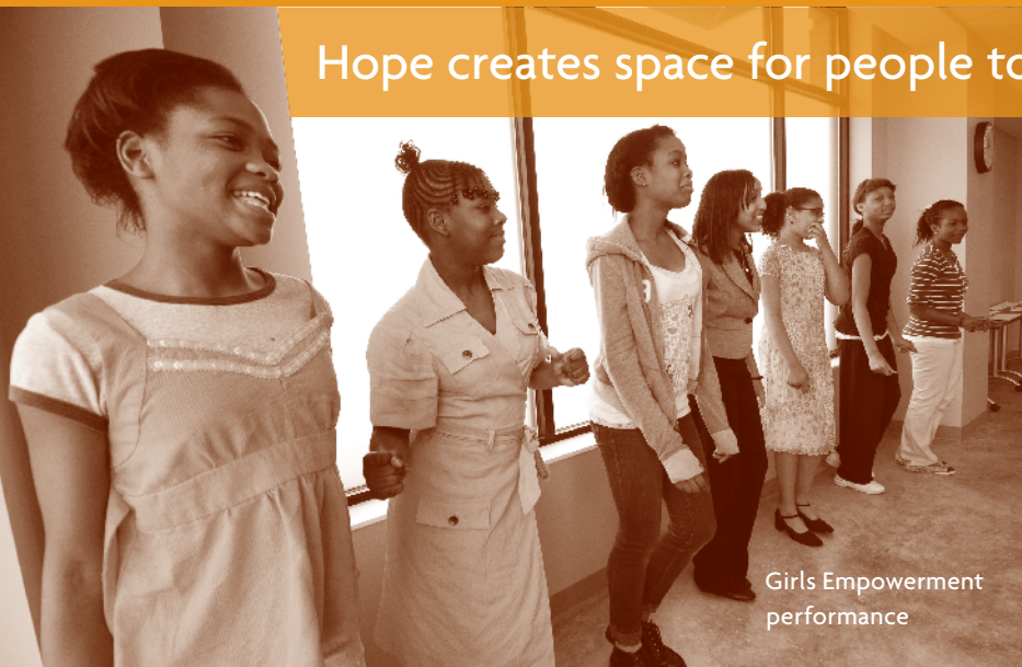
Girls Empowerment performance

Hope creates space for people to define and shape their future.