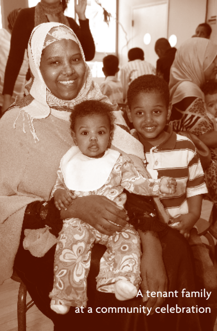
A tenant family at a community celebration