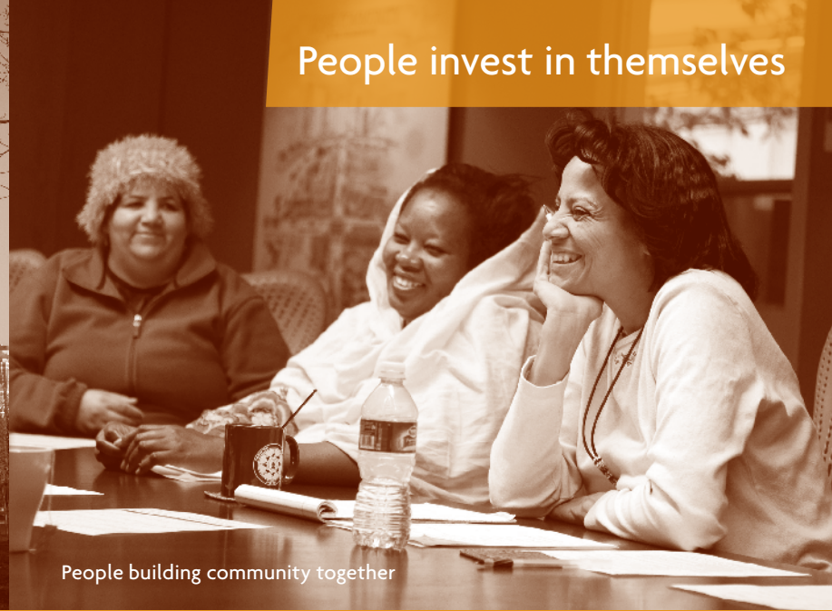
People invest in themselves