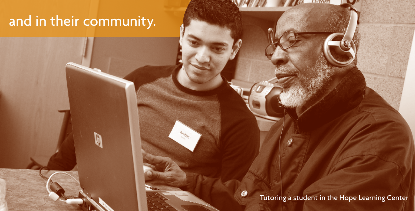
Tutoring a student in the Hope Learning Center