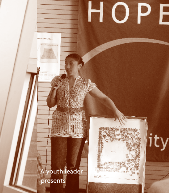
A youth leader presents

child, neighbor to neighbor, student to mentor.