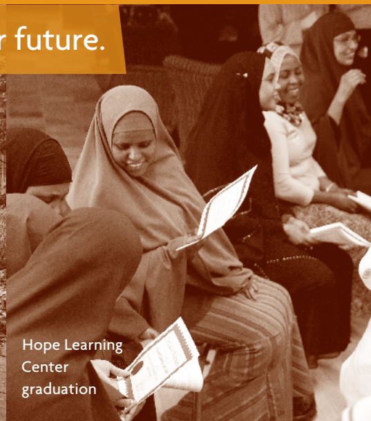
Hope Learning Center graduation