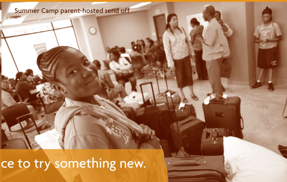
Summer Camp parent-hosted send off

Young people gain the confidence to try something new.