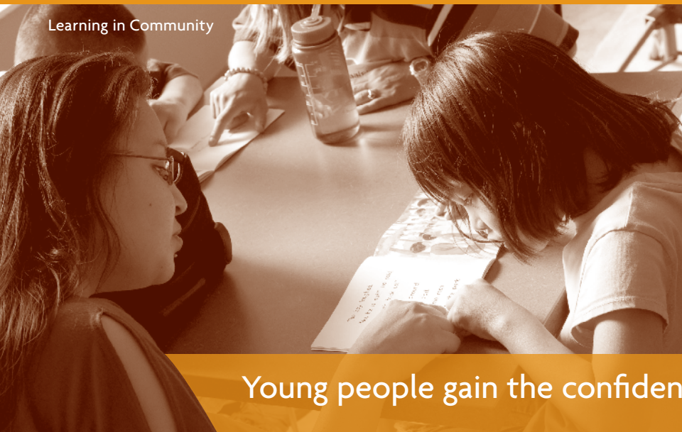
Learning in Community