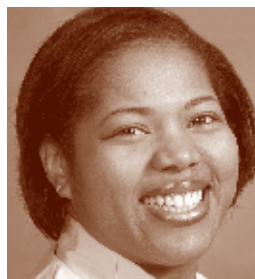
Aretha Rupert Girls Scout Council of Greater Minneapolis